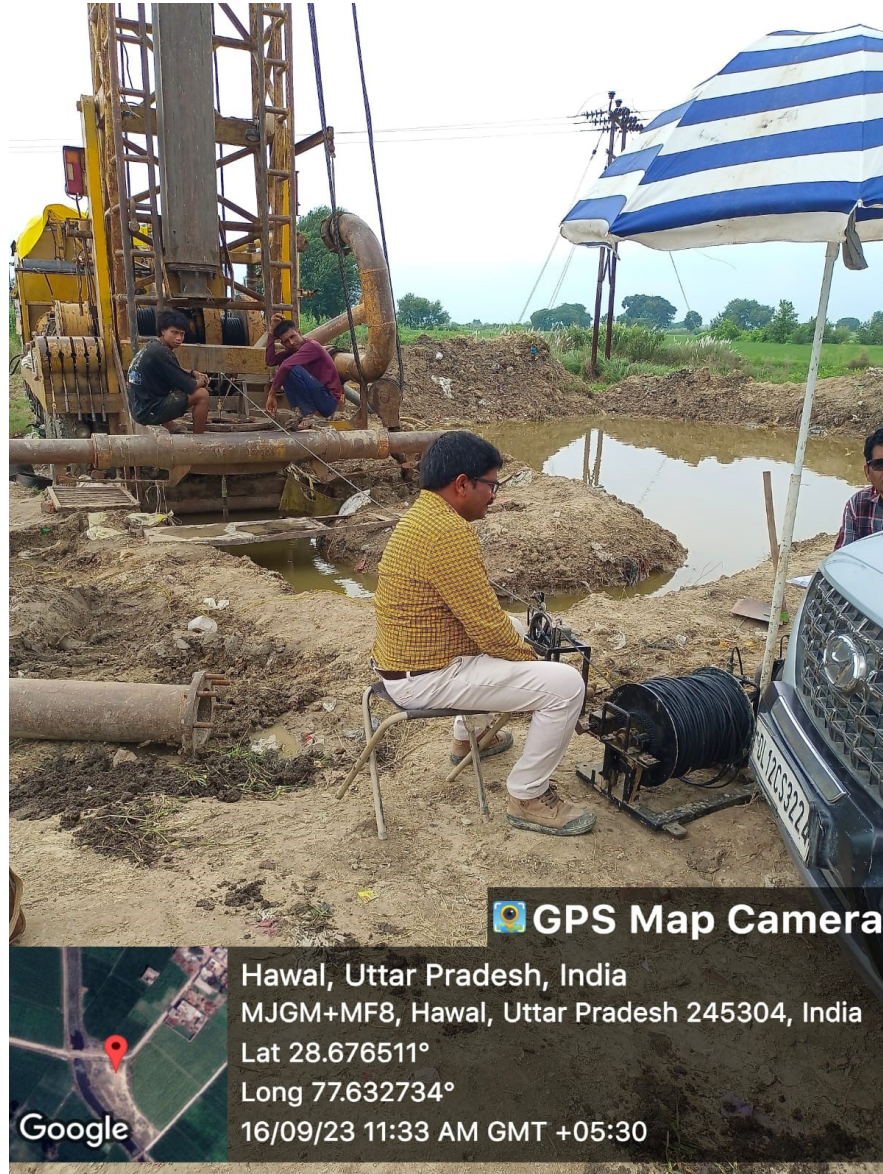
Photo of the Site at the time of Logging