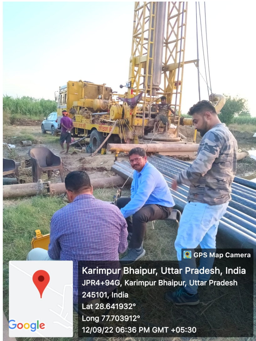
Photo of the Site at the time of Logging