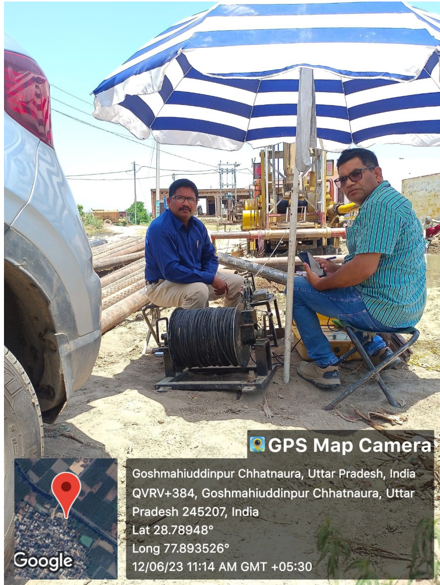
Photo of the Site at the time of Logging