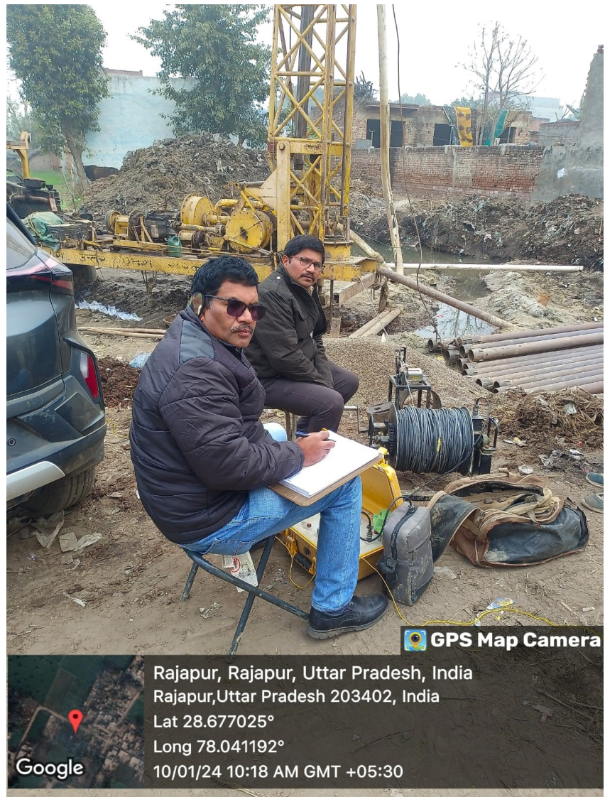
Photo of the Site at the time of Logging