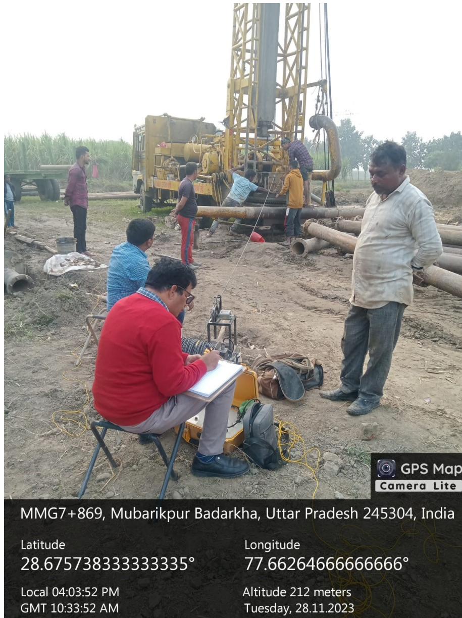
Photo of the Site at the time of Logging