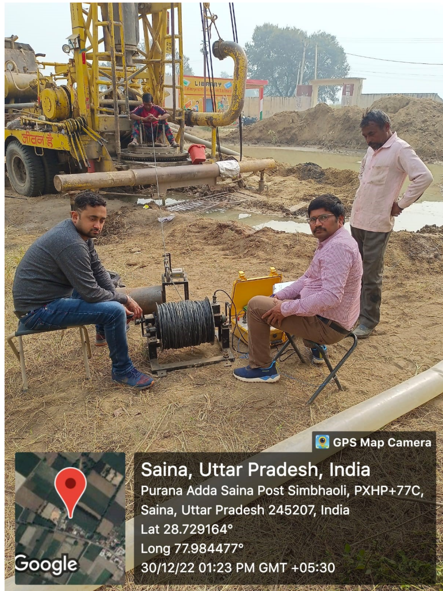
Photo of the Site at the time of Logging