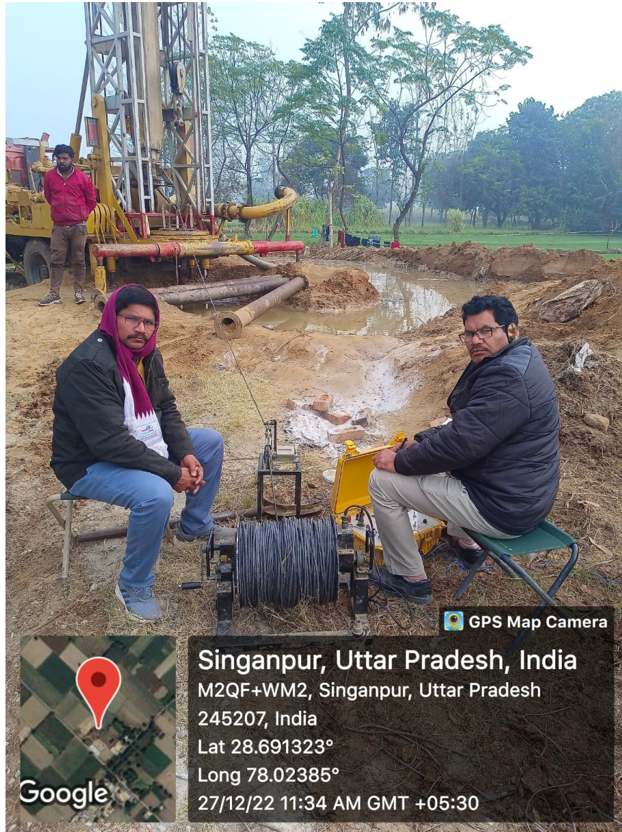
Photo of the Site at the time of Logging