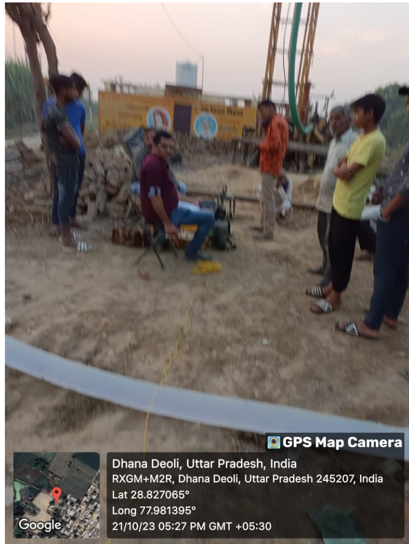
Photo of the site at time of Logging