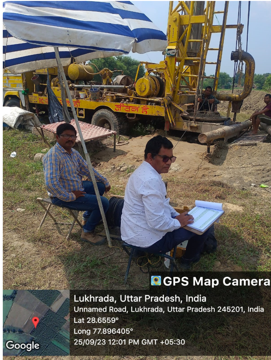
Photo of the site at time of Logging