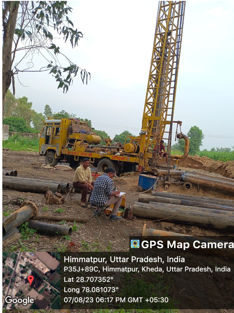
Photo of the site at time of Logging