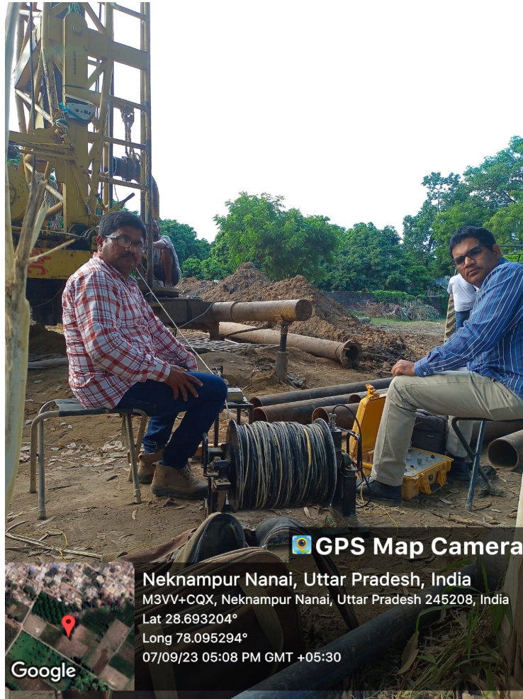
Photo of the site at time of Logging