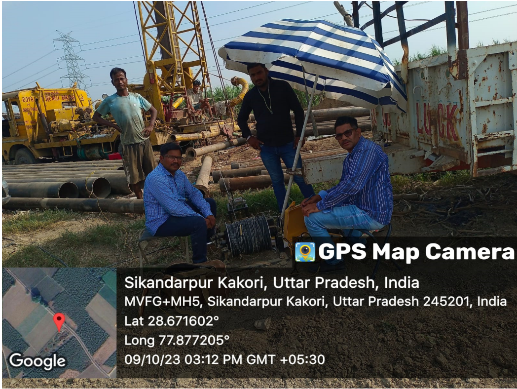
Photo of the site at time of Logging