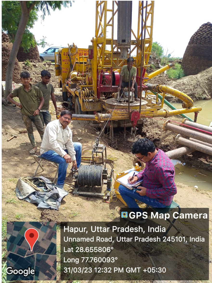
Photo of the Site at the time of Logging