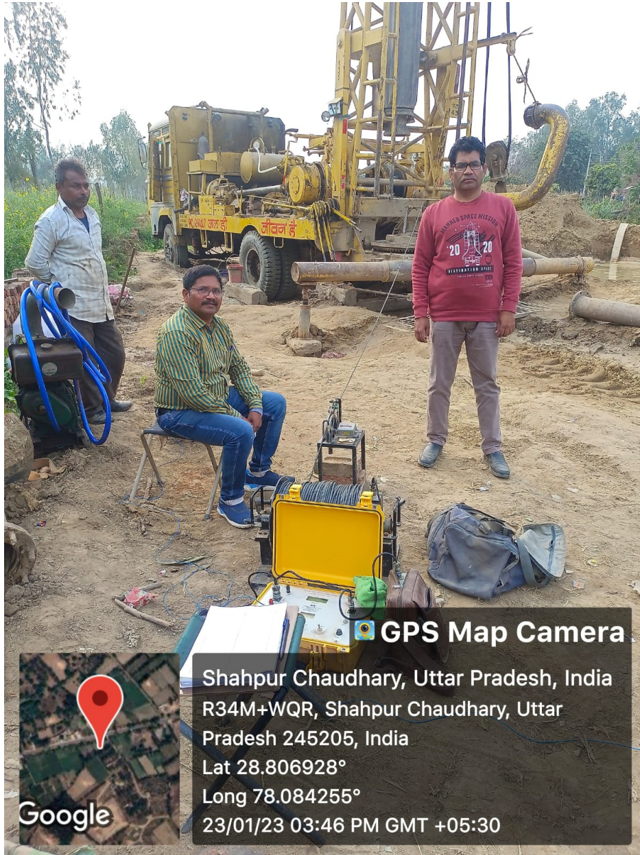
Photo of the Site at the time of Logging