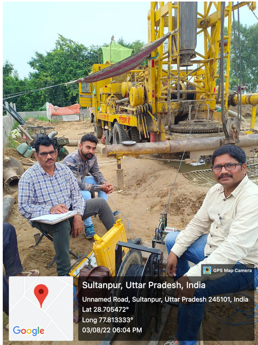
Photo of the Site at the time of Logging