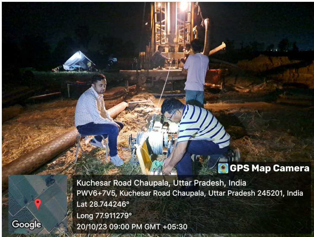
Photo of the site at time of Logging