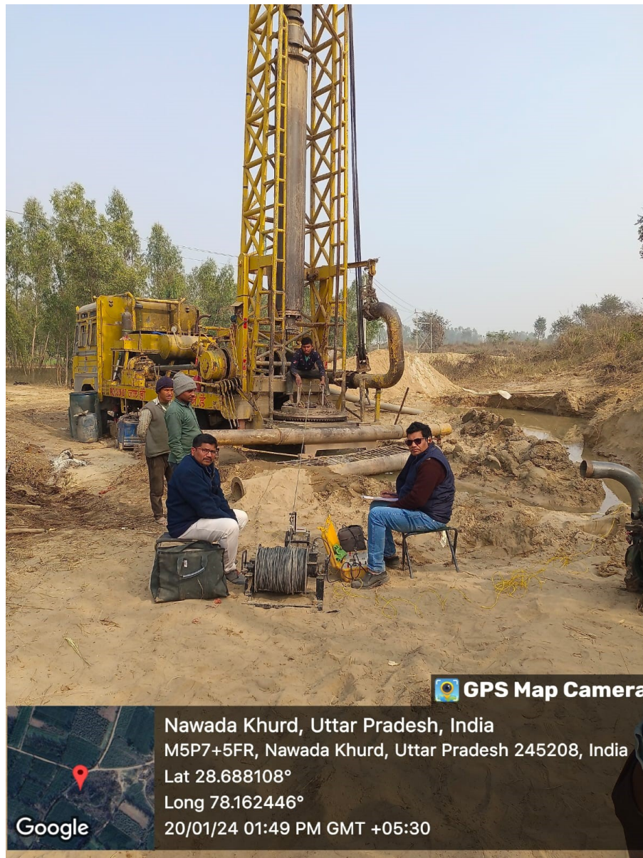
Photo of the Site at the time of Logging