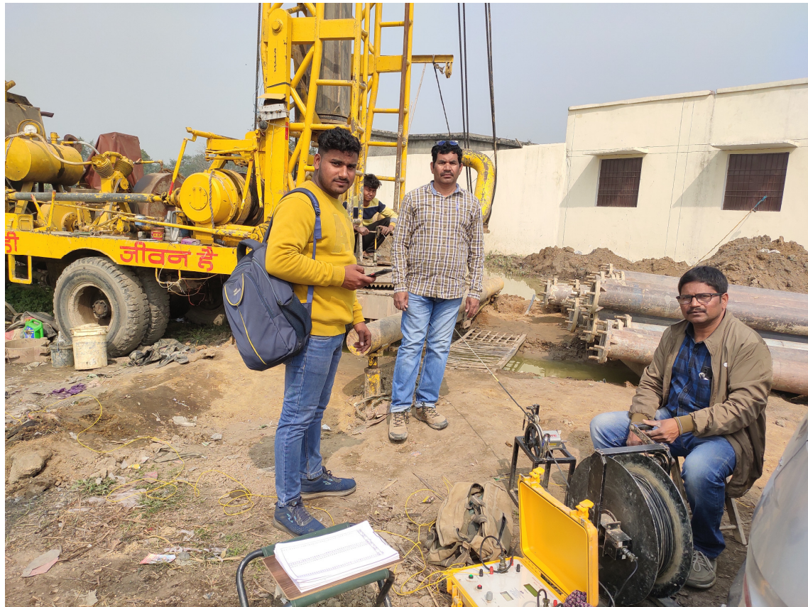
Photo of the Site at the time of Logging