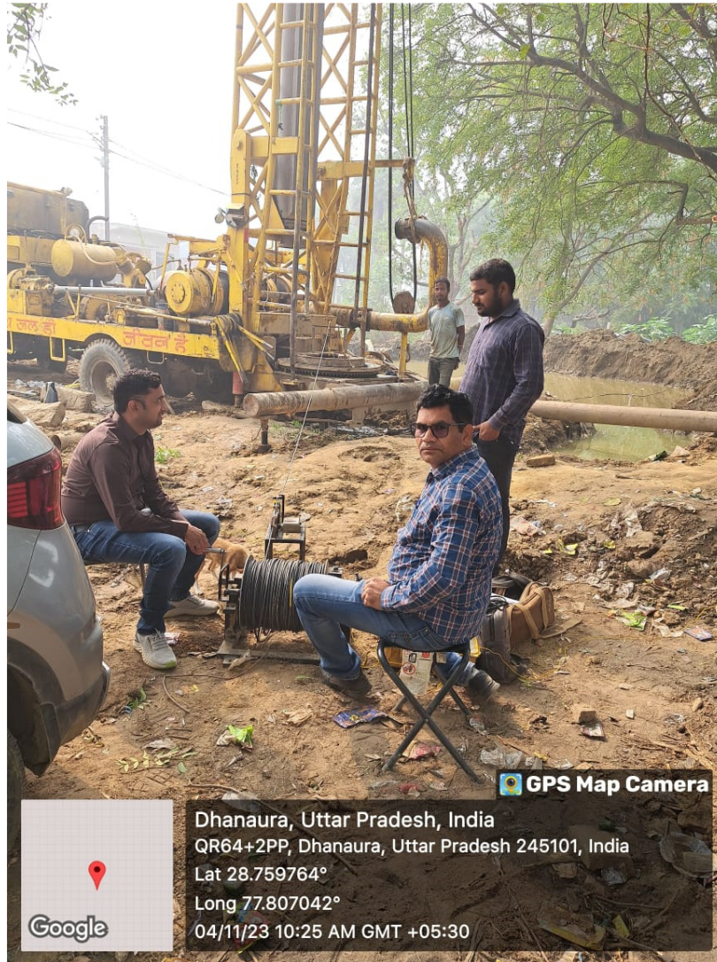
Photo of the site at time of Logging