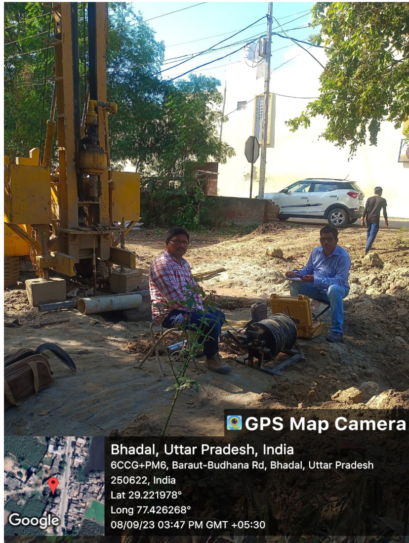
Photo of the site at time of Logging