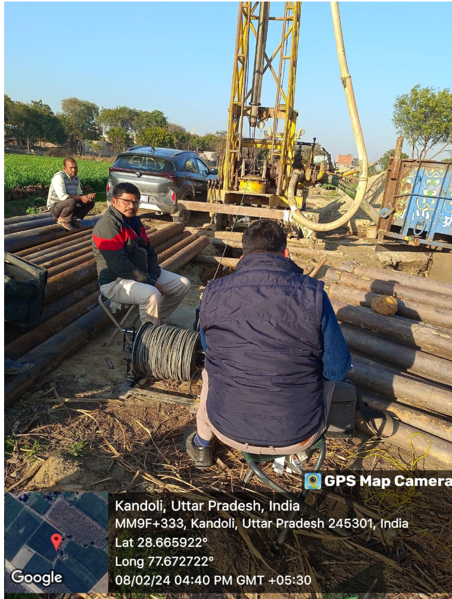
Photo of the Site at the time of Logging