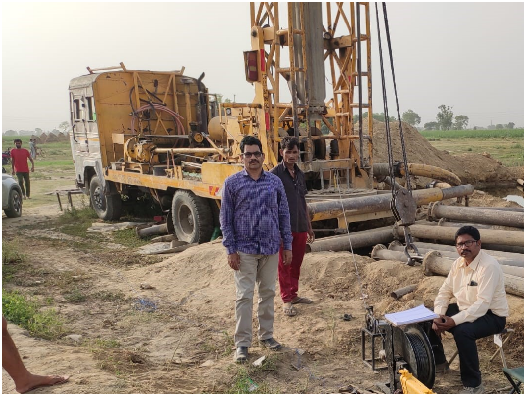
Photo of the Site at the time of Logging