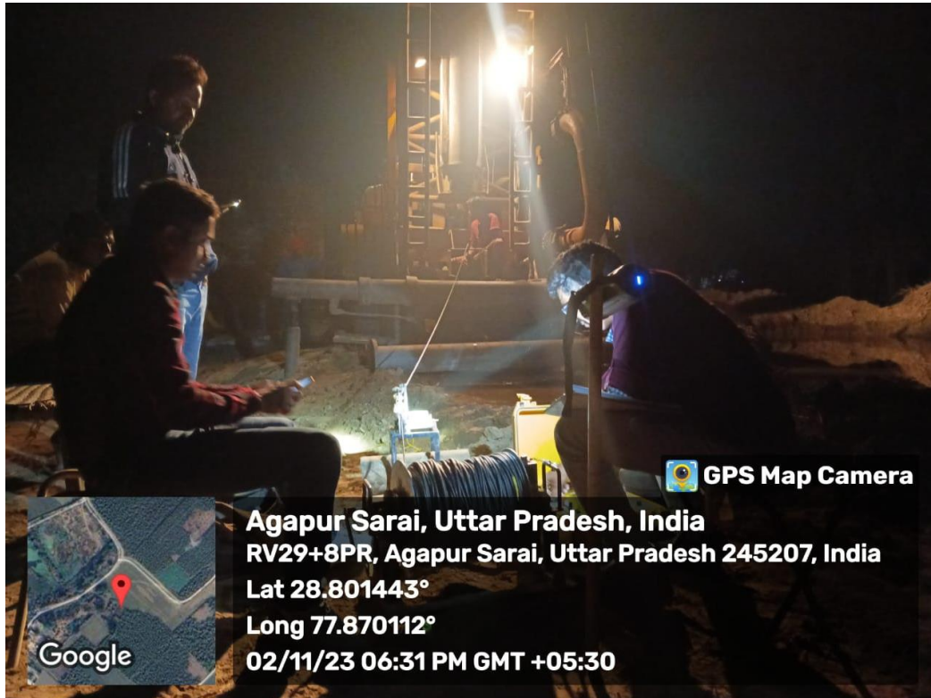
Photo of the site at time of Logging