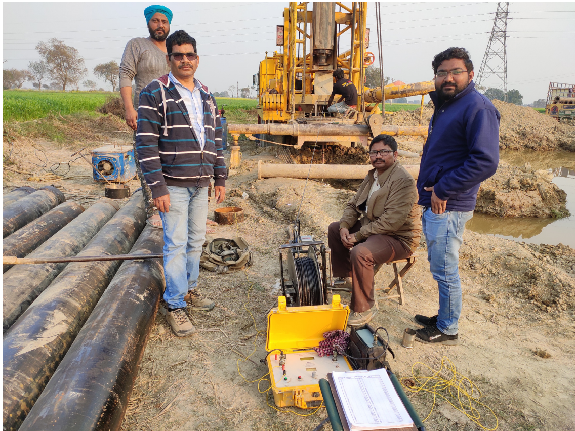
Photo of the Site at the time of Logging