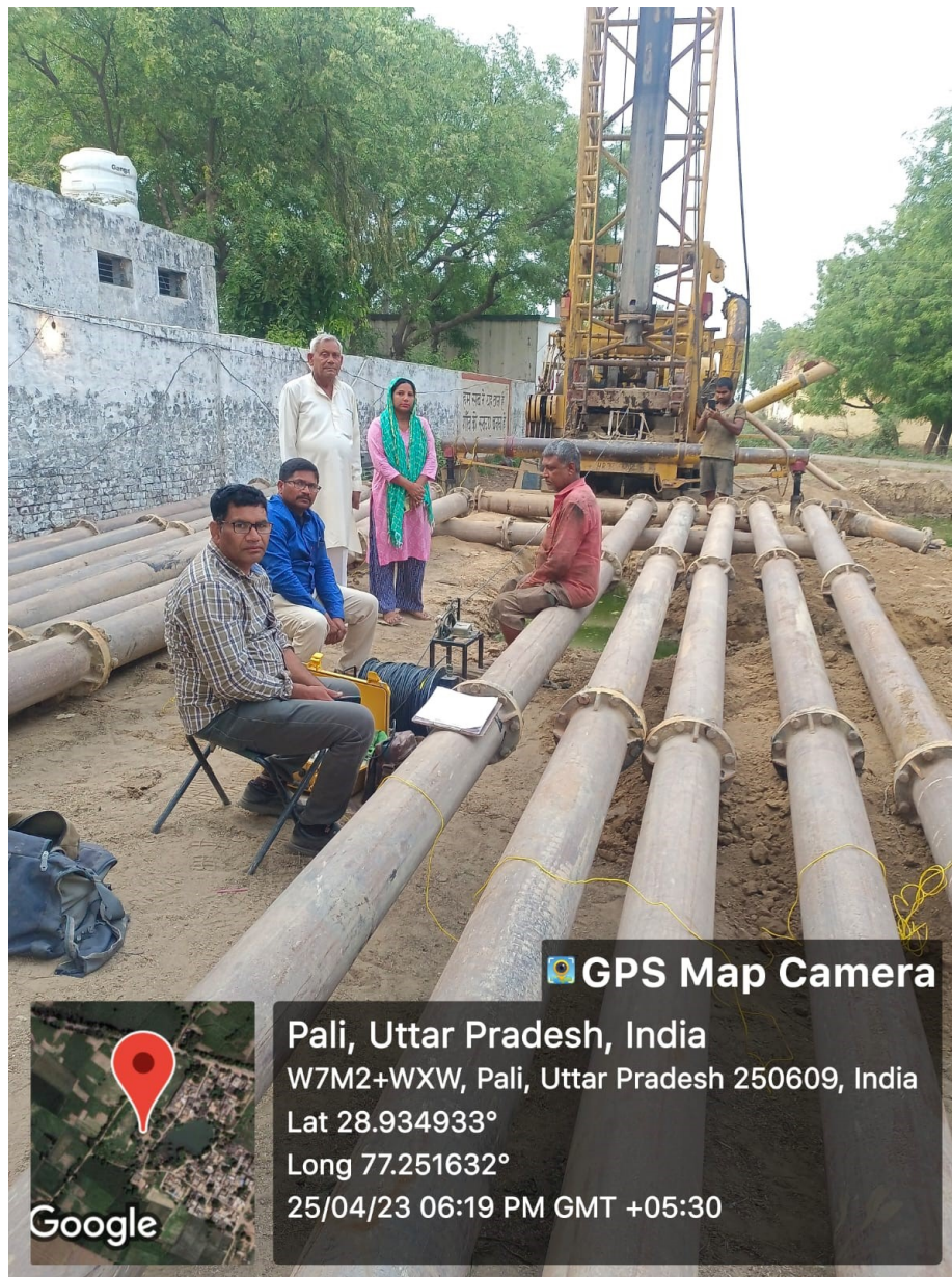
Photo of the Site at the time of Logging