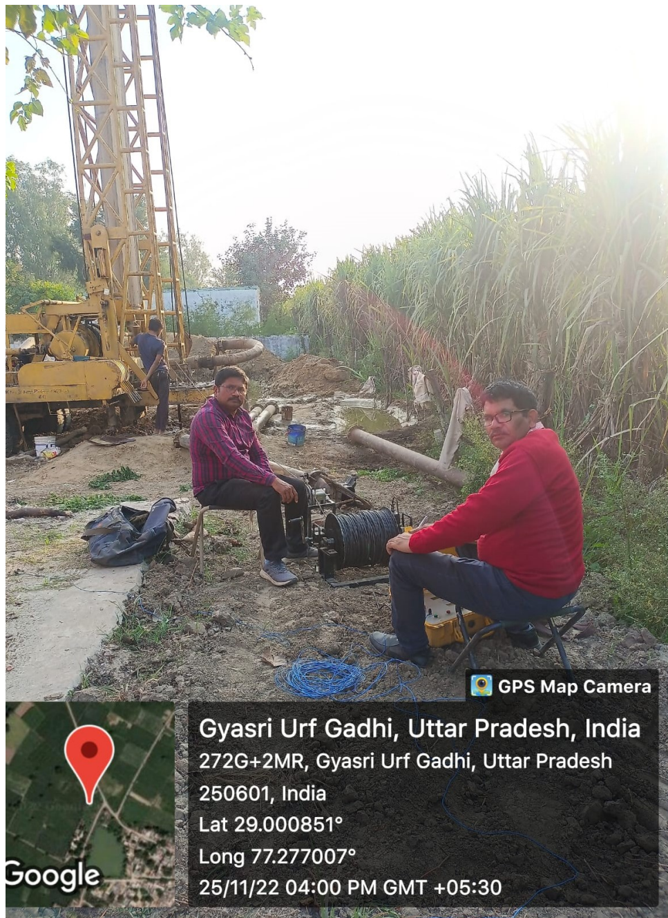
Photo of the Site at the time of Logging