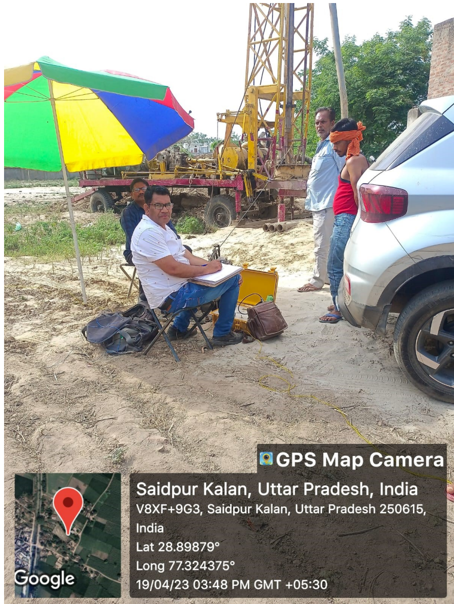
Photo of the Site at the time of Logging