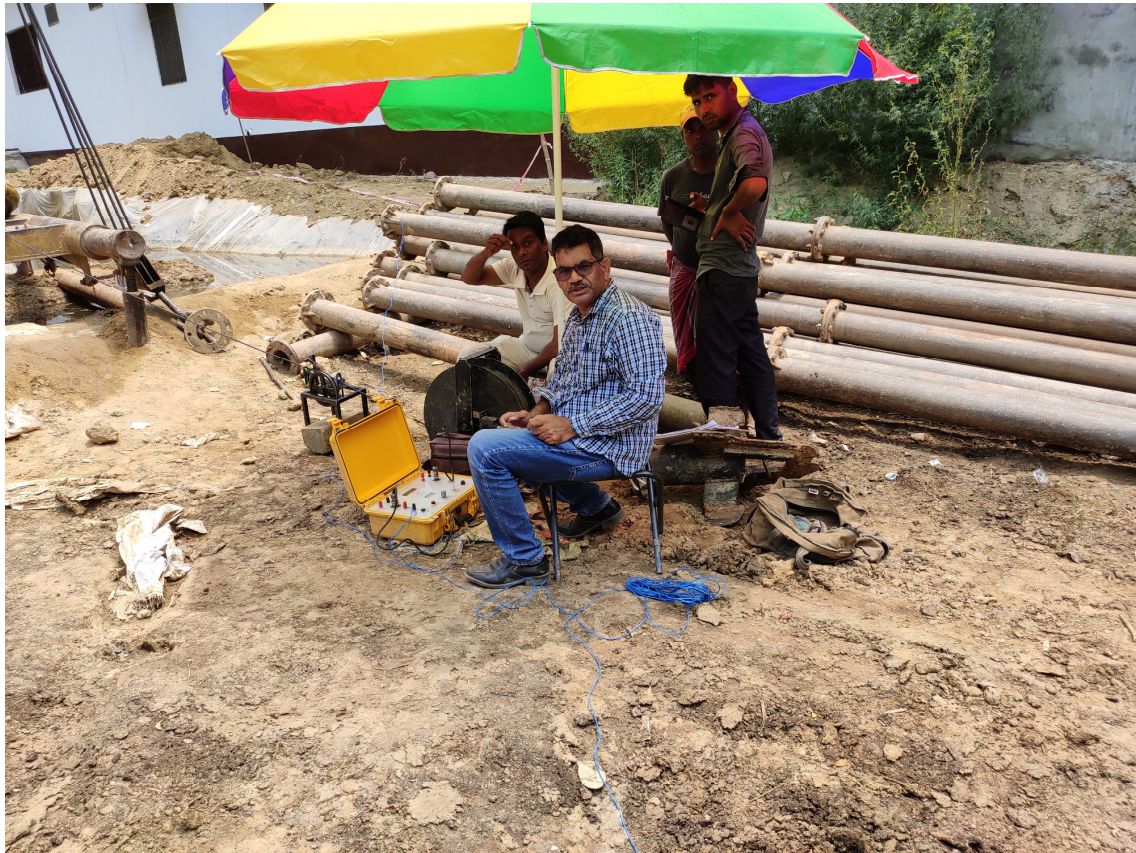
Photo of the Site at the time of Logging