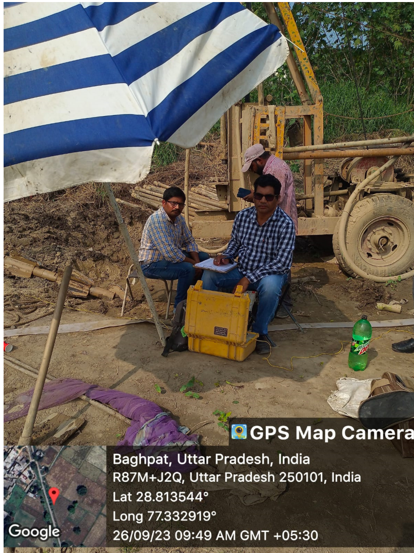
Photo of the site at time of Logging