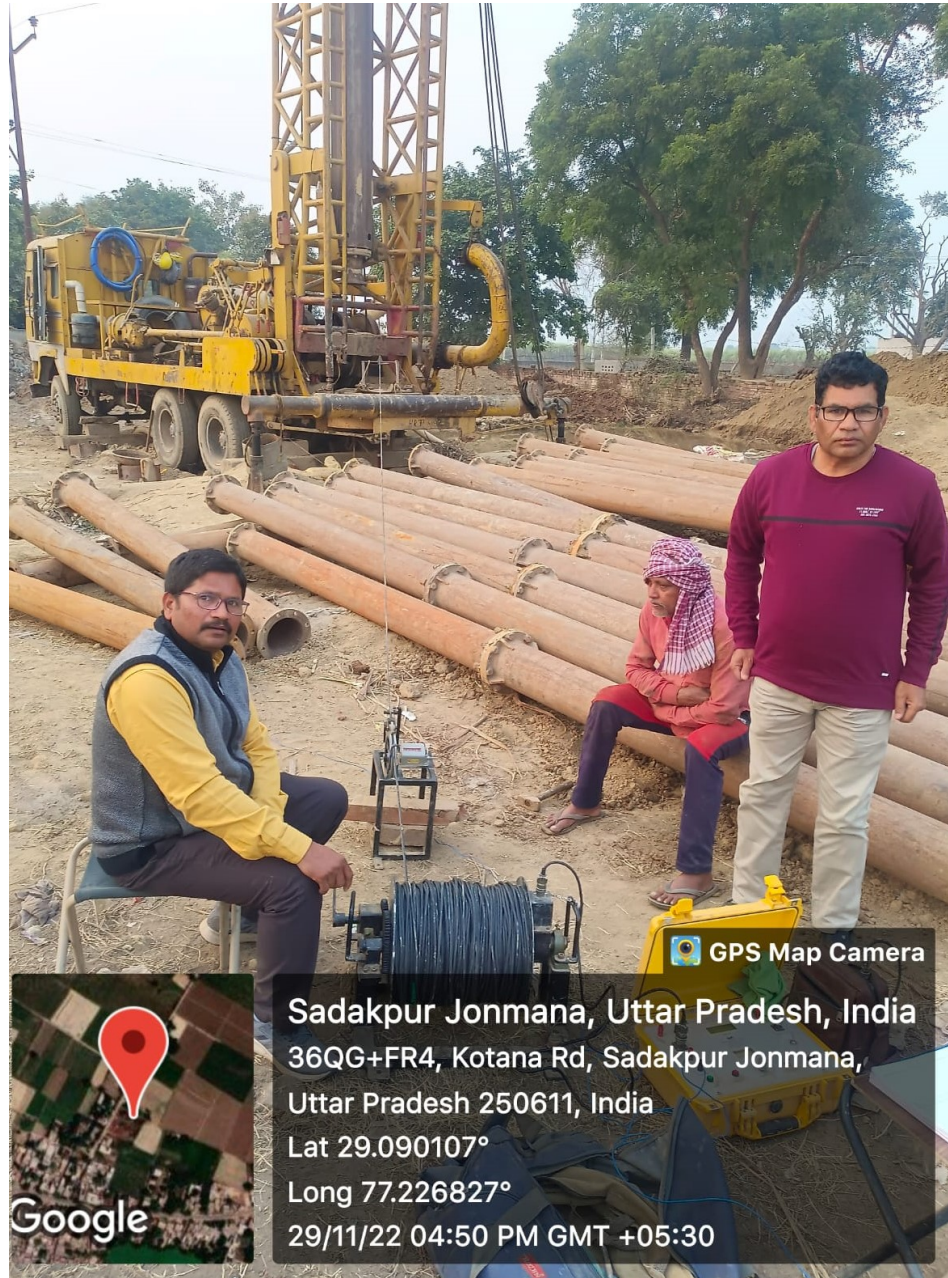
Photo of the Site at the time of Logging